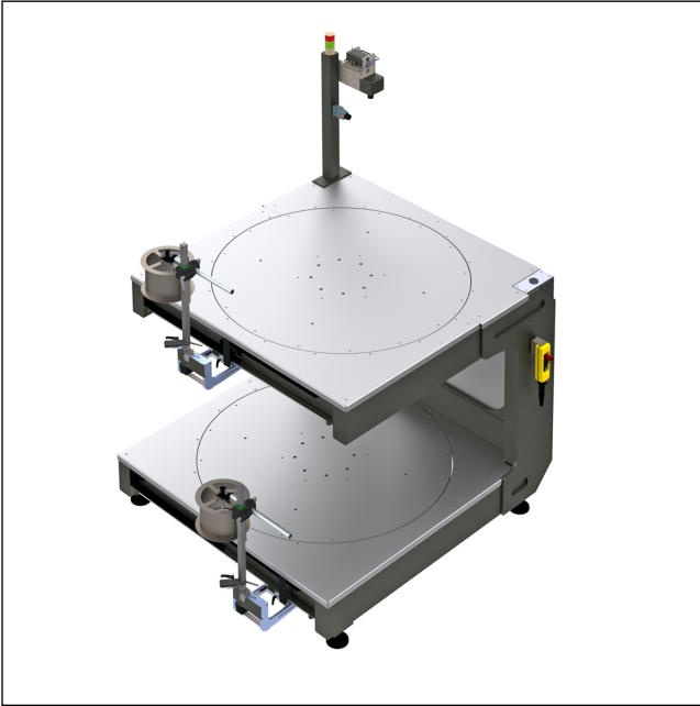
Reel decoiler, horizontal, double