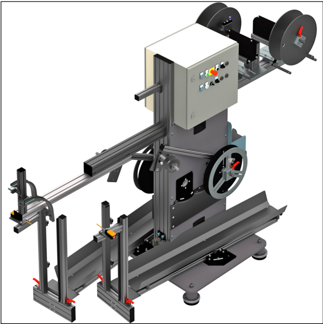
Reel decoiler, vertical, double